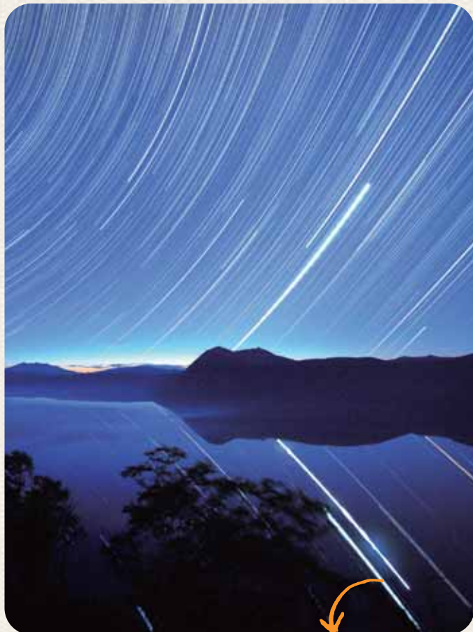
Lake Mashu ☎ 613 781 370 * Lake Mashu Rest House Tel. 015-482-1530