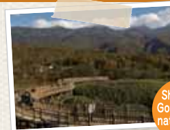
Shiretoko Goko Lakes nature trail