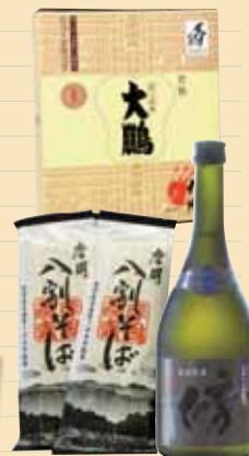
From top: Taiho senbei Mashu soba (left) Mashu buckwheat shochu “Soba” (right)